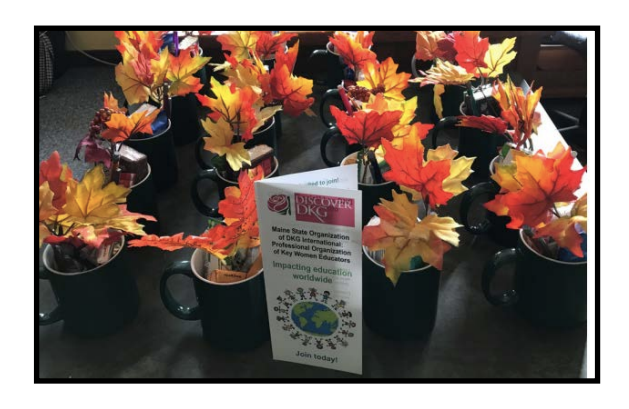
Cups of Care

these as a way of saying, "Thank you for joining the teaching profession, we care about you". Over the past 16 years, 190 cups have been distributed to four districts, made up of fourteen individual schools, and spreading our care for new educators throughout Waldo County!